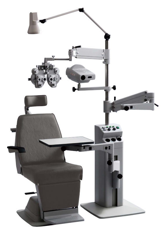
SN-500 combined with Ophthalmic Chair UN-15

* VT-5 View tester, CP-40 Chart projector, UN-15 Ophthalmic chair, U08-04 Projector arm, and U12-05 Slit lamp table top are separately available.